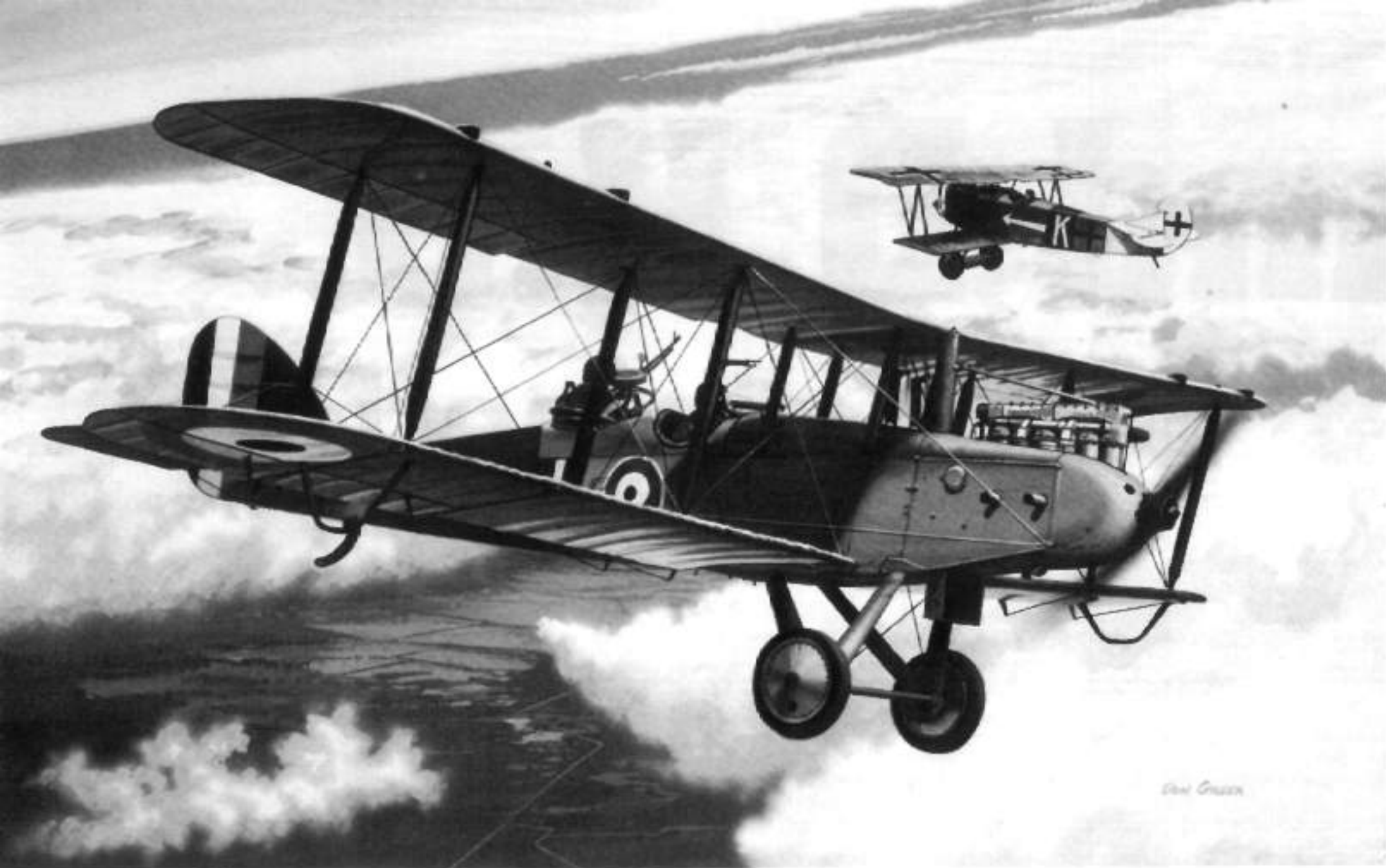
The observer of a RAF D.H.9 prepares to engage a German Fokker D VII fighter over the front lines during the early Spring of 1918.